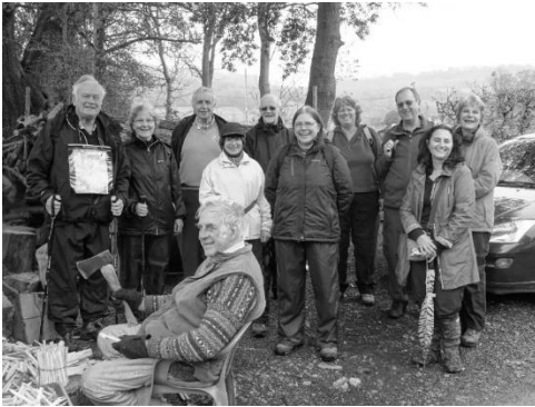
Meeting the 'Woodman'