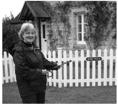
Celebrating Rose's Birthday!