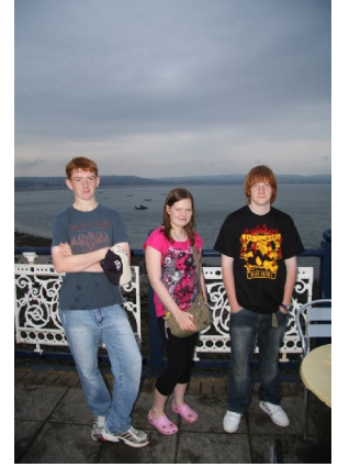
The view to the pier head and us at the end of the pier

We had out first communal time of thought and reflection of the day and after prayers it was as Zebedee said; 'Time for bed'.